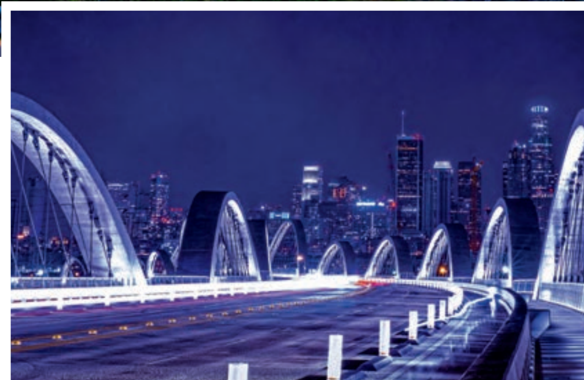
6th Street Bridge, Los Angeles, USA

Known as 'The Ribbon of Light' the new bridge replaced the original 6th Street Viaduct, built in 1932 over the LA River. The viaduct's fluid design includes ten pairs of arches, rising and falling along the north and south edges of the bridge with stunning views of LA on all sides.