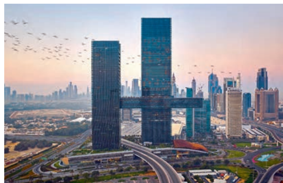
One Za'abeel Towers, Dubai, UAE

Measuring 67.5m, the world's longest cantilever forms part of a horizontal structure called The Link, a bridge, dramatically suspended between two skyscrapers at the mixed-use One Za'abeel development, soaring 100m above a six-lane highway and topped by a giant infinity pool.