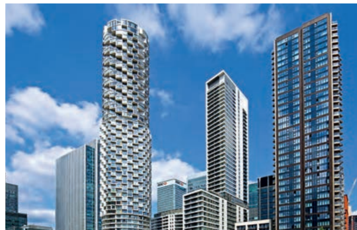
One Park Drive, Canary Wharf, London, UK

Cylindrical in shape, with 484 apartments and penthouses over 57 storeys, this residential tower adds a new dimension to an area dominated by commercial space. White terracotta and offset balconies define the appearance of the façade and infuse it with a fine, structured character.